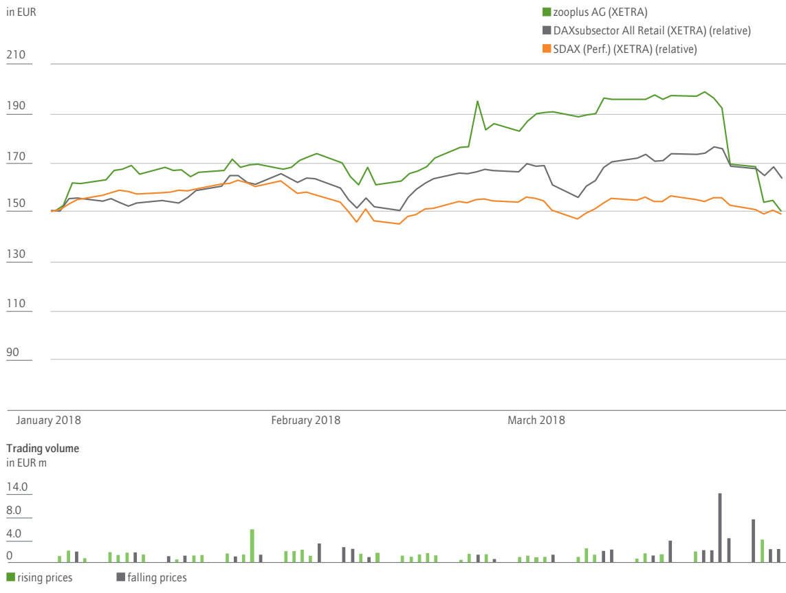
Stock chart zooplus AG: January 2, 2018 to March 29, 2018